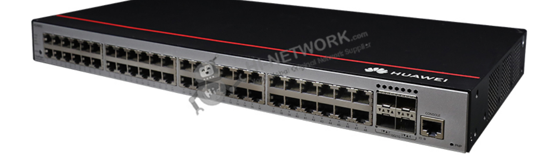
Figure 1 shows the appearance of S5735S-L48T4X-A1.