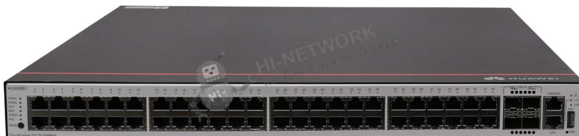
Figure 1 shows the appearance of S5735-S48P4X.