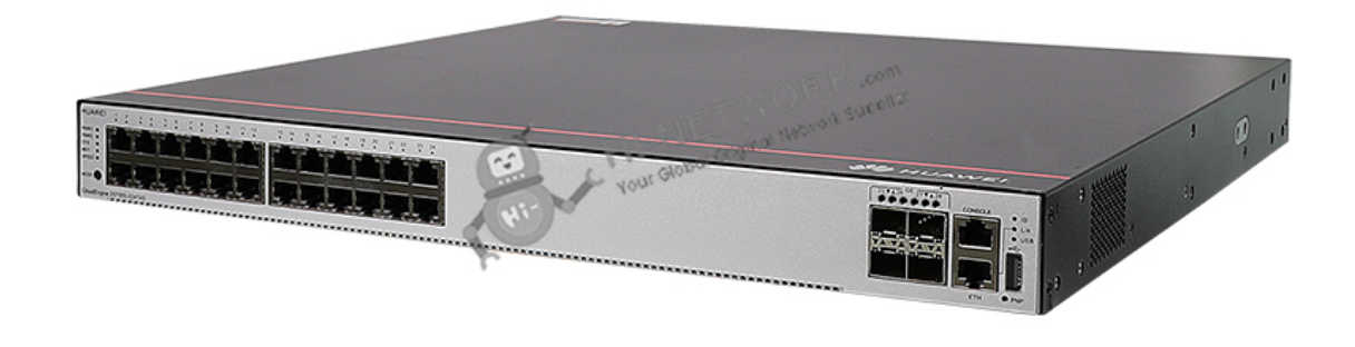
Figure 1 shows the appearance of S5735S-S24T4S-A.