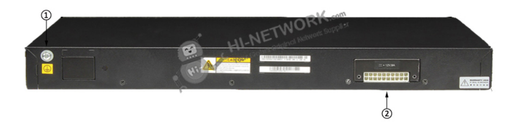
Figure 3 shows the back panel of S5701-28X-LI-AC.