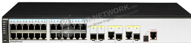
Figure 1 shows the appearance of S5700-28TP-LI-AC.