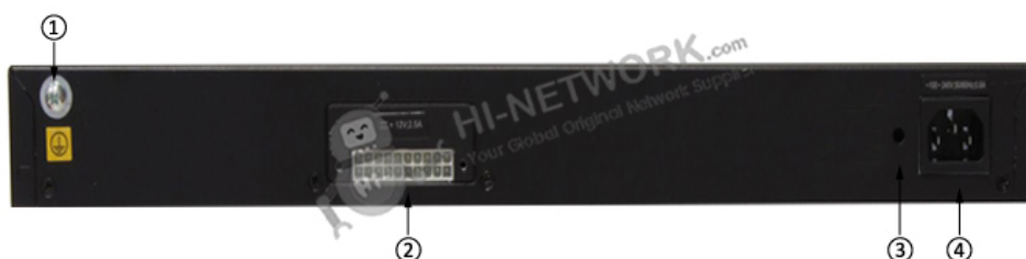
Figure 3 shows the back panel of S5700-28TP-LI-AC.