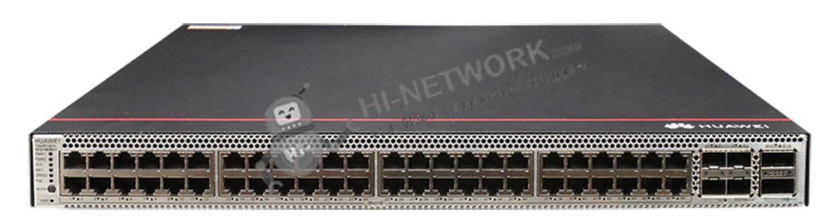
Figure 1 shows the appearance of S5732-H48UM2CC.