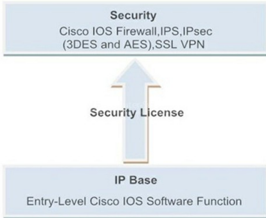
Figure 4 shows the Security License function.