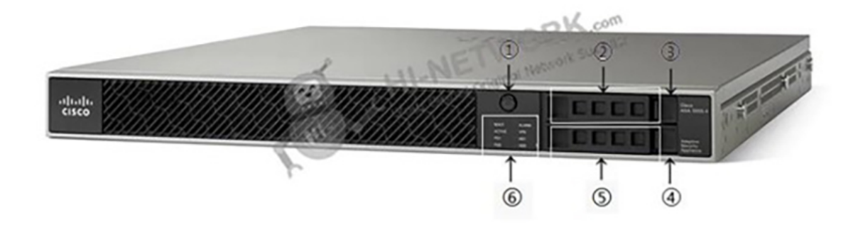
Figure 2 shows the front panel.