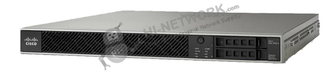
\label{eq:Figure 1} \textbf{Figure 1 shows the appearance of ASA5555-K9.}