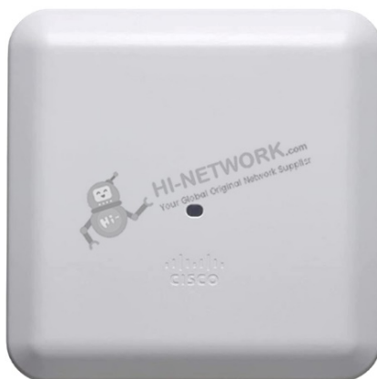
Figure 1 shows the appearance of the AIR-AP2802I-A-K9.