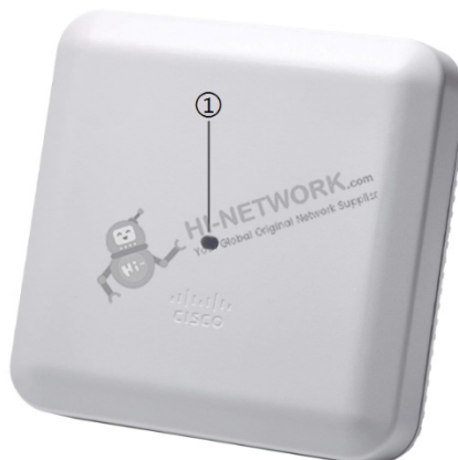
Figure 2 shows the face of AIR-AP2802I Model.