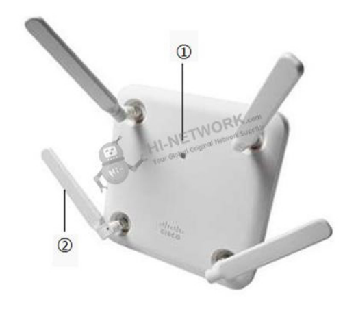
Figure 2 shows the AIR-AP1852E LED Indicator Position.