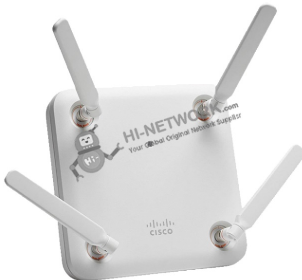
Figure 1 shows the appearance of the AIR-AP1852E-C-K9.