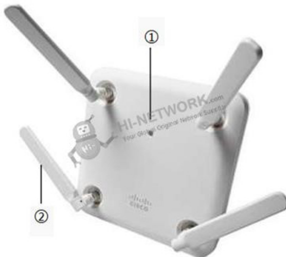
Figure 2 shows the AIR-AP1852E LED Indicator Position.