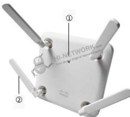
Figure 1 shows the AIR-AP1852E LED Indicator Position.