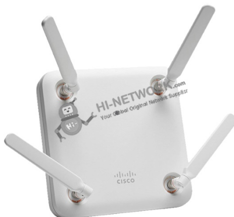
Figure 1 shows the appearance of the AIR-AP1852E-H-K9.