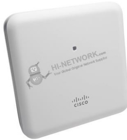
Figure 1 shows the appearance of the AIR-AP1852I-H-K9C.