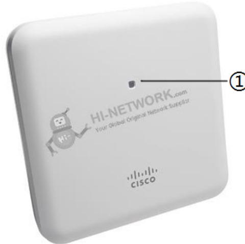
Figure 2 shows the AIR-AP1852I LED Indicator Position.