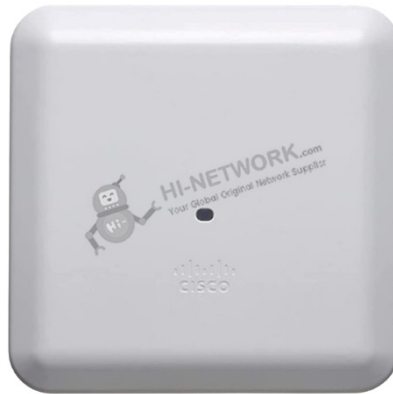
Figure 1 shows the appearance of the AIR-AP2802I-A-K9.