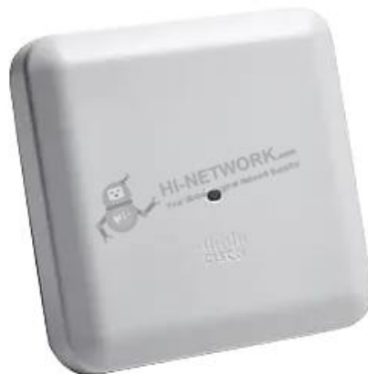
Figure 2 shows the face of AIR-AP2802I Model.