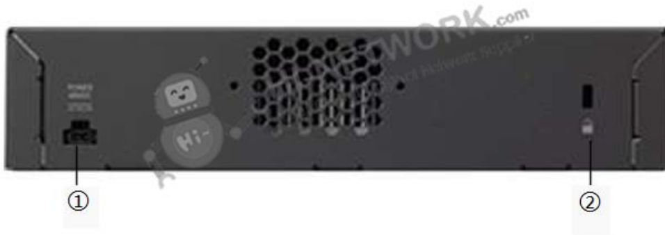
Figure 3 shows the back panel of AIR-CT2504-25-K9.