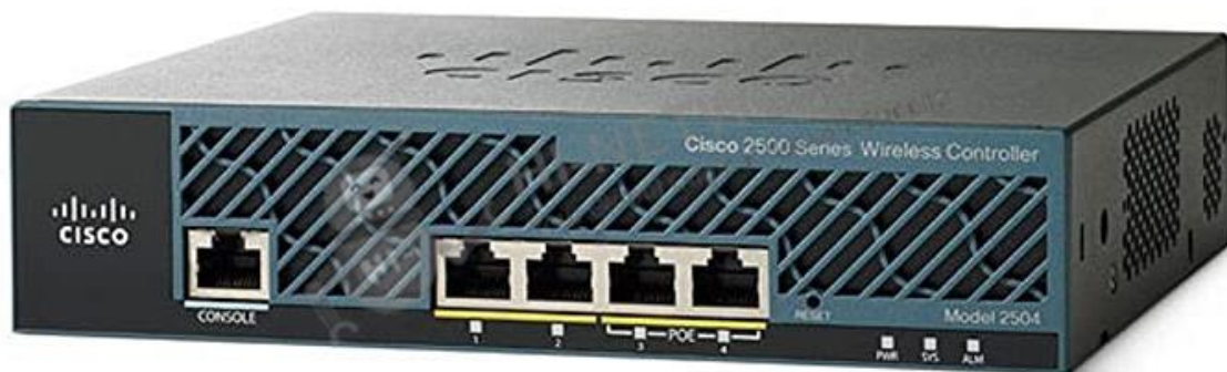
Table 1 shows the quick specs of AIR-CT2504-25-K9.

Figure 1 shows the appearance of AIR-CT2504-25-K9.