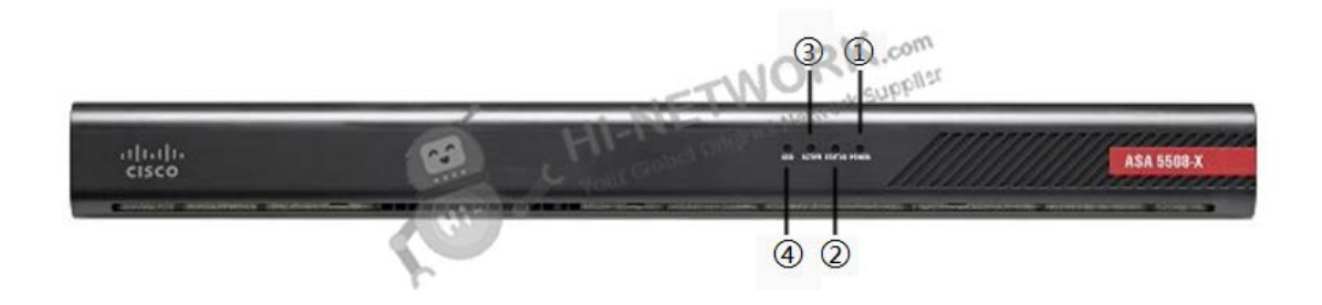
Table 2 shows the description of Status LED on the front panel.