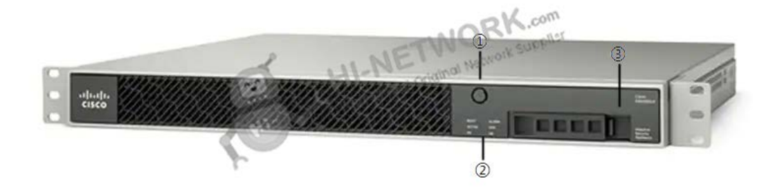
Figure 2 shows the front panel of ASA5515- K9.