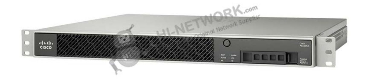
Figure 1 shows the appearance of ASA5515- K9.