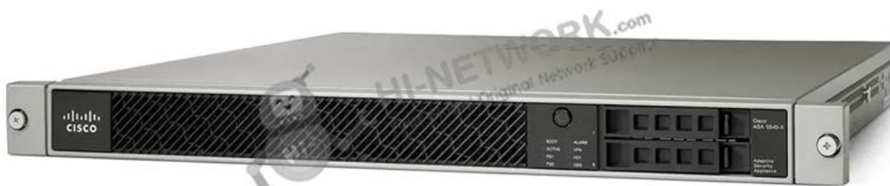
Figure 1 shows the front panel of ASA5545-K9 for reference. ASA5545-K8 has the similar ports.