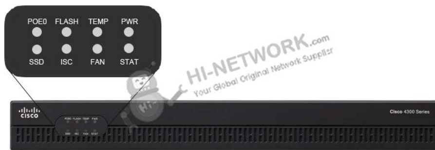
Figure 2 shows the LEDs on the front panel of the Cisco ISR4321/K9 for reference. ISR4321-V/K9 is similar with it.

· There are eight LEDs on the front panel.