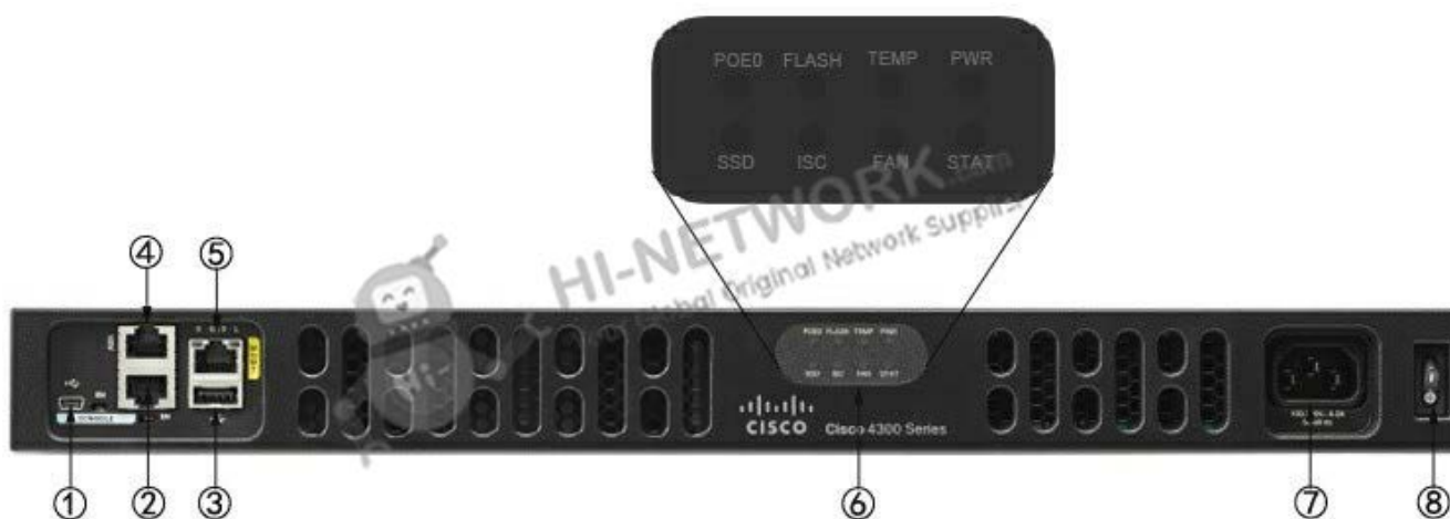
Figure 2 shows the front panel of Cisco ISR4331-SEC/K9.