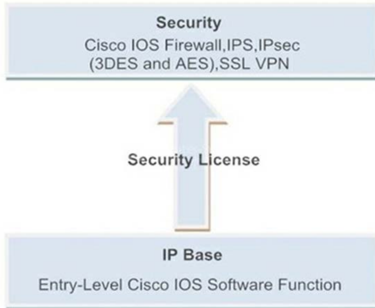
Figure 4 shows Security Bundle Functions.