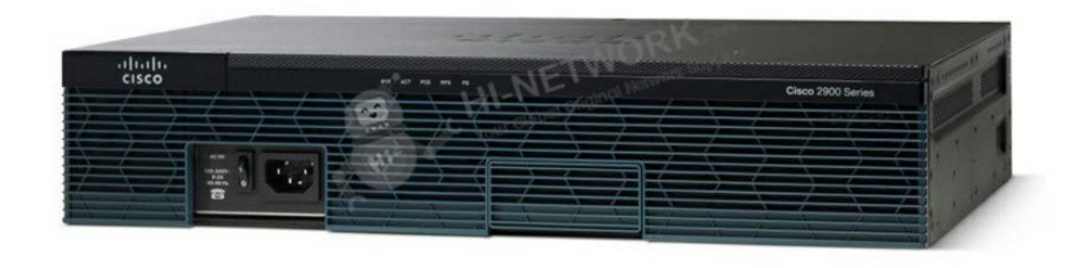
Figure 1 shows the product appearance of Cisco2911-V/K9.