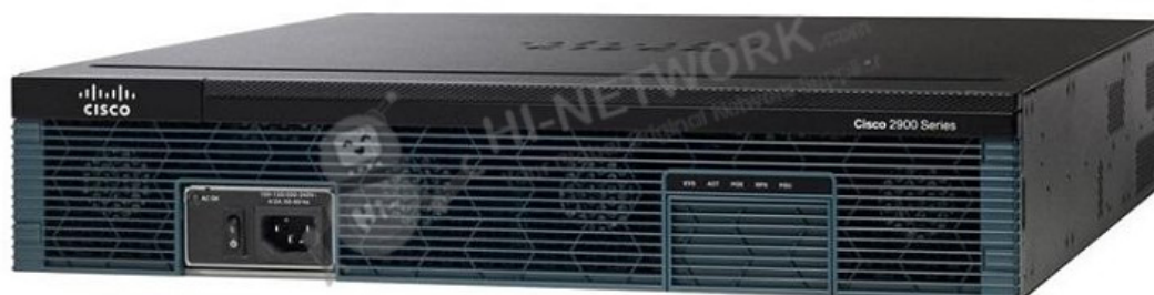
Figure 1 shows the appearance of the CISCO2921-V/K9.