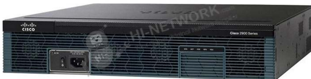
Figure 1 shows the front view of CISCO2921-SEC/K9.