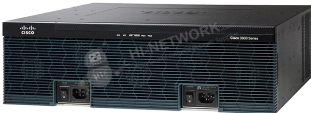
Figure 1 shows the appearance of CISCO3945-V/K9.