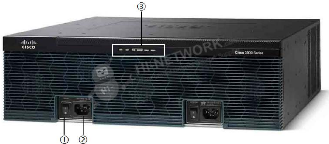
Figure 2 shows the front panel of the CISCO3945-V/K9.