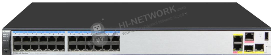
Figure 1 shows the appearance of AR2204-27GE-P.