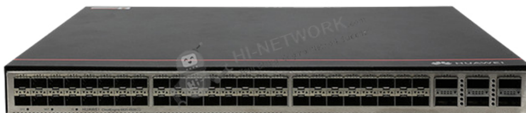
Figure 1 shows the appearance of CE6820-48S6CQ-B.