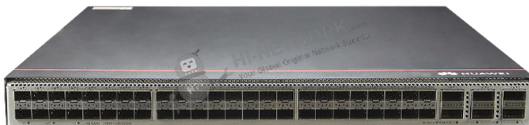
Figure 1 shows the appearance of CE6857-48S6CQ-EI.