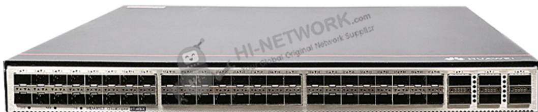
Figure 1 shows the appearance of CE6857E-48S6CQ-B.