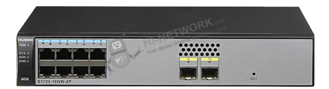
Figure 1 shows the appearance of S1720-10GW-2P.