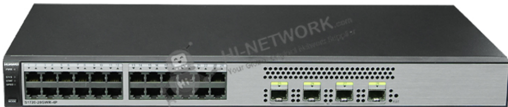
Figure 1 shows the appearance of S1720-28GWR-4P.