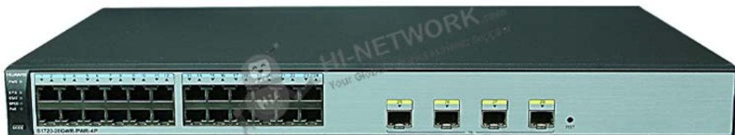
Figure 1 shows the appearance of S1720-28GWR-PWR-4P.