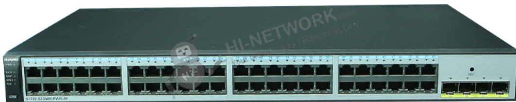
Figure 1 shows the appearance of S1720-52GWR-PWR-4P-E.