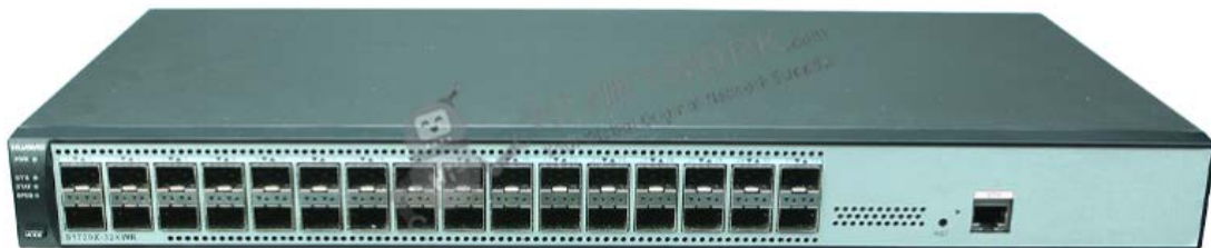
Figure 1 shows the appearance of S1720X-32XWR.