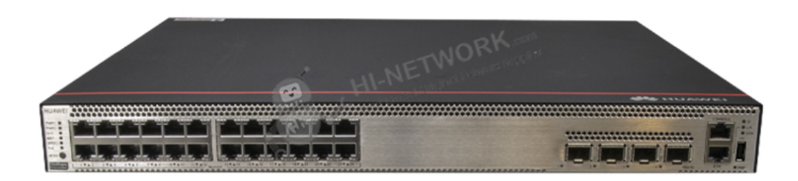
Figure 1 shows the appearance of S5736-S24UM4XC.

Buy Huawei, Cisco, Zte, Hpe, Dell, Fortinet Network Equipment Online In China At Low Price! www.hi-network.com